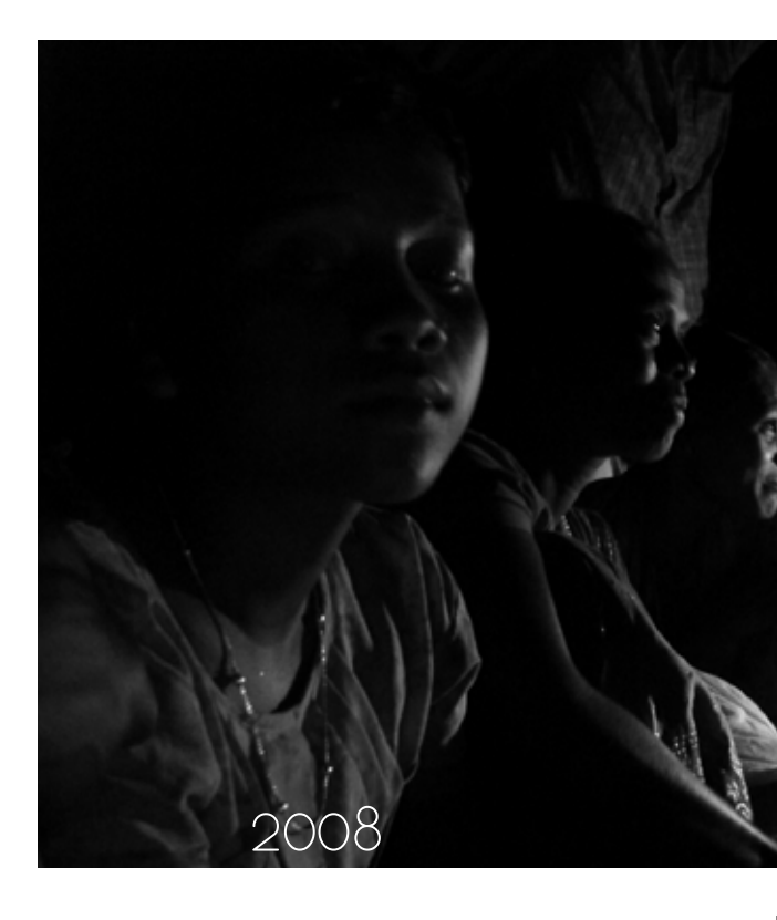
cover, table of contents and in between pages illustrations

74 the birth of something else PATRICE MANIGLIER